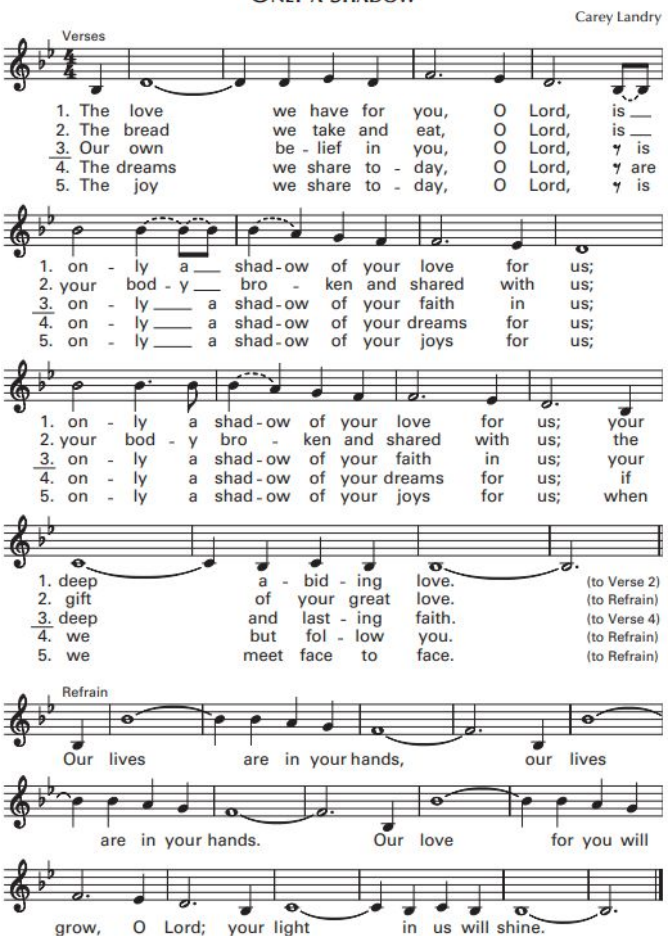
© 1971, Carey Landry and OCP. All rights reserved.