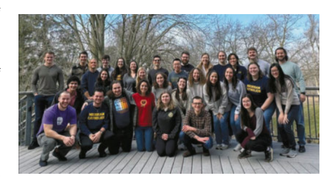
Grad/YP group at Weber Center on February 4

Taken. Blessed. Broken, Shared. This is the ongoing cycle of God's presence and activity in the world. During this time of Lent, may you be caught by God, made holy, broken open, and offered up for the greater honor and glory of God.