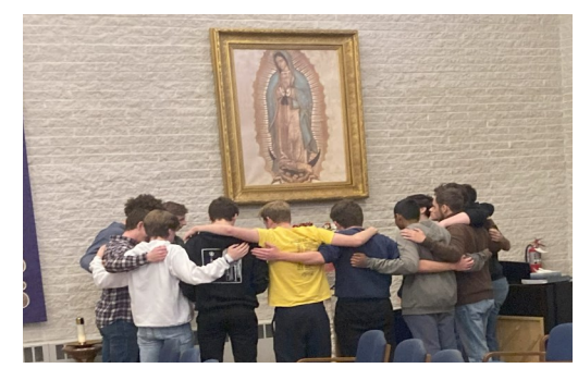
Some pictures of the retreat at the Capuchin Retreat Center , February 16th – 18th.